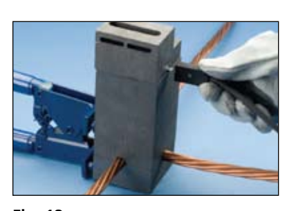
Fig. 18 Place the ignition strip into the control unit connector. Remove or protect fire hazards in close proximity to the connection.