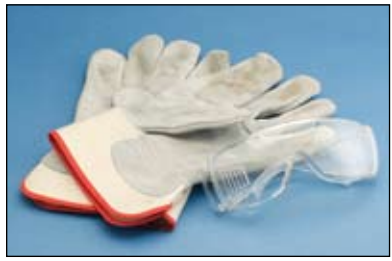
Fig. 1 Always wear protective safety glasses and gloves while working with CADWELD® exothermic products.