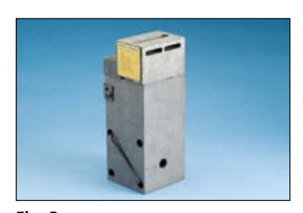
Fig. 3 Check to ensure the graphite mold is not worn or broken, which could cause leakage of molten weld metal during the reaction.

NOTE: Additional materials may be required for your specific application. Refer to your mold instructions. Advise nearby personnel of welding operations in the area prior to ignition.