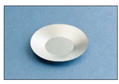
Fig. 15 Steel disk found inside the packaging box of welding material.