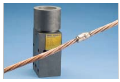
Fig. 31 You are ready to make another CADWELD connection.

CADWELD® EXOLON graphite molds will last approximately 50 connections. Use a soft cotton cloth or a soft bristle brush (ERICO® part #T394) to clean inside the mold cavity and cover; remove any slag left from the exothermic reaction.