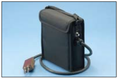
Fig. 24 CADWELD® EXOLON battery pack.