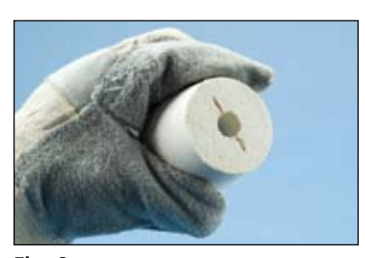
Fig. 6 Each CADWELD PLUS ONE SHOT contains a copper wire at the bottom of the mold.

Scrape the outer surface to remove dirt and oxidation. You will notice a slight color change.