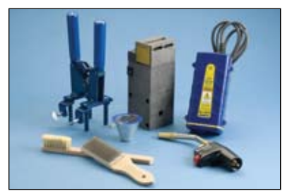
Fig. 2 Prepare the proper materials and equipment for the type of connection you are making. The CADWELD® PLUS system requires a graphite mold, mold clamp, CADWELD PLUS welding material cup, natural bristle brush for mold cleaning, wire brush for cleaning/preparing conductors, control unit, and propage torch.

NOTE: Additional materials may be required for your specific application. Refer to your mold instructions. Advise nearby personnel of welding operations in the area prior to ignition.