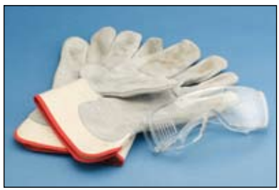
Fig. 1 Always wear protective safety glasses and gloves while working with CADWELD® exothermic products.