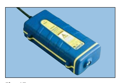
Fig. 17 Battery powered control unit.