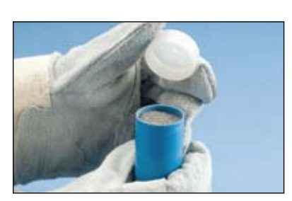
Fig. 20 Next, take the tube of welding material included in the CADWELD® EXOLON package and remove the lid over the mold crucible.