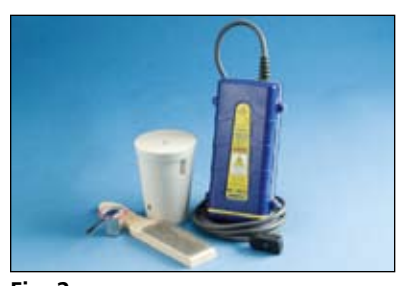
Fig. 2 Prepare the proper materials and equipment for the type of connection you are making. The CADWELD®

type of connection you are making. The CADWELD® PLUS ONE SHOT system requires a CADWELD® ONE SHOT ceramic mold, CADWELD® PLUS welding material, wire brush for cleaning/preparing conductors, control unit, and propane torch.