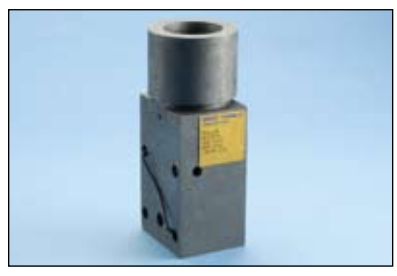
Fig. 3 Check to ensure the graphite mold is not worn or broken, which could cause leakage of molten weld metal during the reaction.

NOTE: Additional materials may be required for your specific application. Refer to your mold instructions. Advise nearby personnel of welding operations in the area prior to ignition.