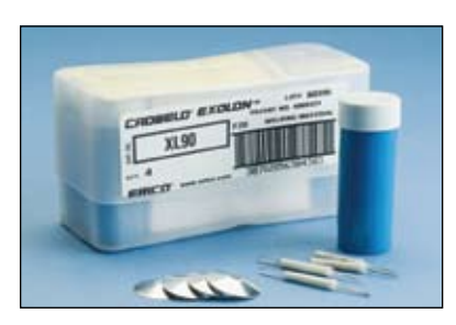
Fig. 13 Weld metal package (includes welding material, discs, filters and ignitors for 4 connections).