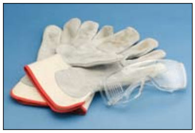
Fig. 1 Always wear protective safety glasses and gloves while working with CADWELD® exothermic welding products.