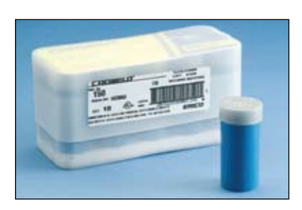
Fig. 18 Next, take a tube of properly sized welding material (as identified on the mold ID tag) out of the box.