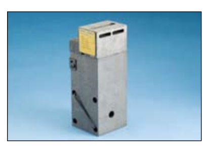
Fig. 3 Check to ensure the graphite mold is not worn or broken, which could cause leakage of molten weld metal during the reaction.

NOTE: Additional materials may be required for your specific application. Refer to your mold instructions. Advise nearby personnel of welding operations in the area prior to ignition.