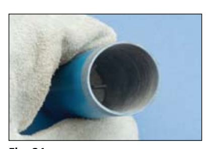
Fig. 21 The bottom of the tube contains compressed material (starting material). Tap the bottom of the tube a couple of times to loosen this material.