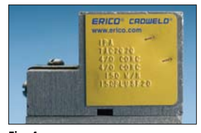
Fig. 4 Inspect the mold ID tag to ensure that it corresponds to the application, indicated by the: