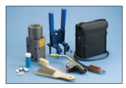
Fig. 2 Prepare the proper materials and equipment for the type of connection you are making. The CADWELD® EXOLON system requires a CADWELD EXOLON

graphite mold, handle clamp, welding material, wire brush for cleaning/preparing conductors, battery pack, and propane torch.