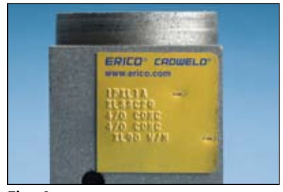
Fig. 4 Inspect the mold ID tag to ensure that it corresponds to the application, indicated by the: