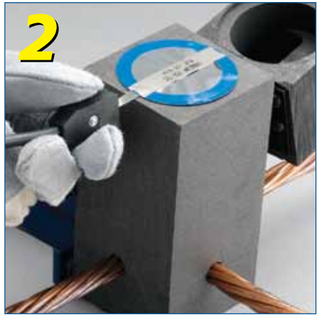
Attach control unit termination clip to ignition strip

CADWELD PLUS Control Unit initiates the reaction of the metal crucible. The standard unit includes a 6-foot (1.8 meter) high temperature control unit lead. The lead attaches to the ignition strip using a custom made, purpose-designed termination clip.