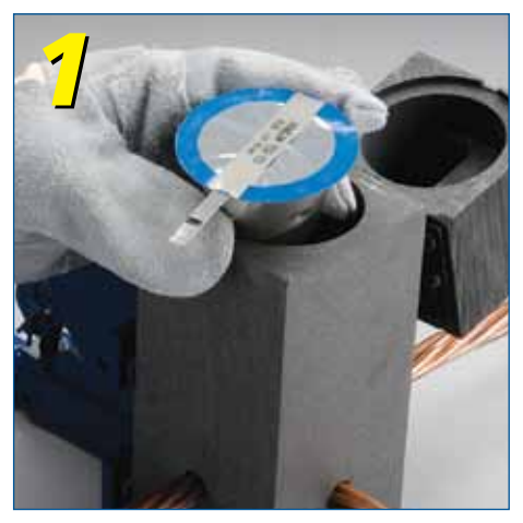
Insert CADWELD PLUS cup into mold (may require use of a cover/baffle)