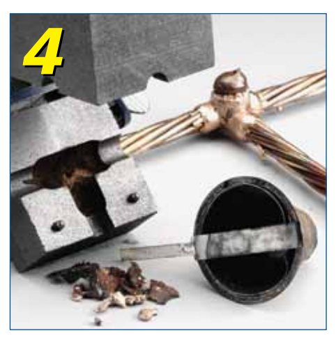
Open the mold and remove the expended steel cup – no special disposal required

After the termination clip is installed on the ignition strip, the installer pushes and holds the ignition button to start a charging and discharging sequence. Within a few seconds the control unit sends a predetermined voltage to the ignition strip and the reaction is initiated.