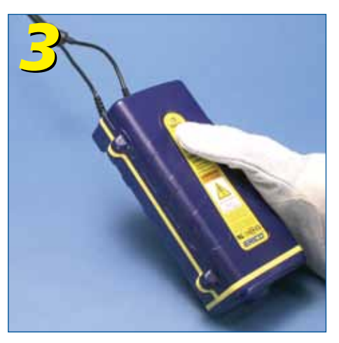
Press and hold control unit switch and wait for the ignition

CADWELD PLUS Control Unit initiates the reaction of the metal crucible. The standard unit includes a 6-foot (1.8 meter) high temperature control unit lead. The lead attaches to the ignition strip using a custom made, purpose-designed termination clip.